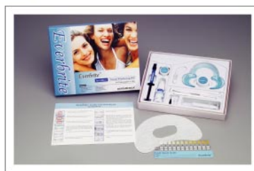
Everbrite™ In-Office Tooth Whitening Kit