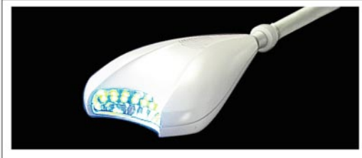
LED Whitening Arch