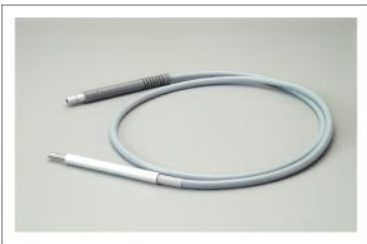
Handpiece Cable Fingertip Activator Ring

■ LITEX 686 LED — Camphorquinone ■ Halogen Lamps