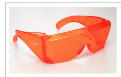
Eye Protection Glasses