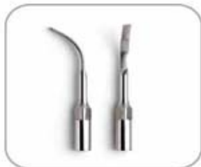
Reorder No. 88005 Chisel