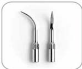
Reorder No. 88003 Universal A