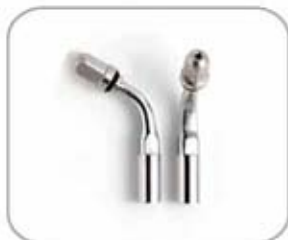
Reorder No. 88002 Endo Chuck