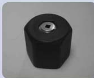
Reorder No. 88009 Torque-limiting Tip Wrench

Unique compact foot control designed to be activated at any angle and accessible from 360° degrees.