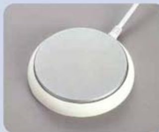
Reorder No. 88060 Foot Control

Autoclavable handpiece with piezo ceramic crystals and titanium tip socket structure.