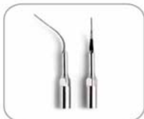
Reorder No. 88006 Perio