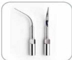
Reorder No. 88004 Universal B