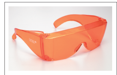
Eye Protection Glasses