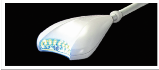
LED Whitening Arch