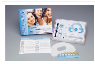
Everbrite ® In-Office Tooth Whitening Kit