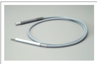
Handpiece Cable Fingertip Activator Ring